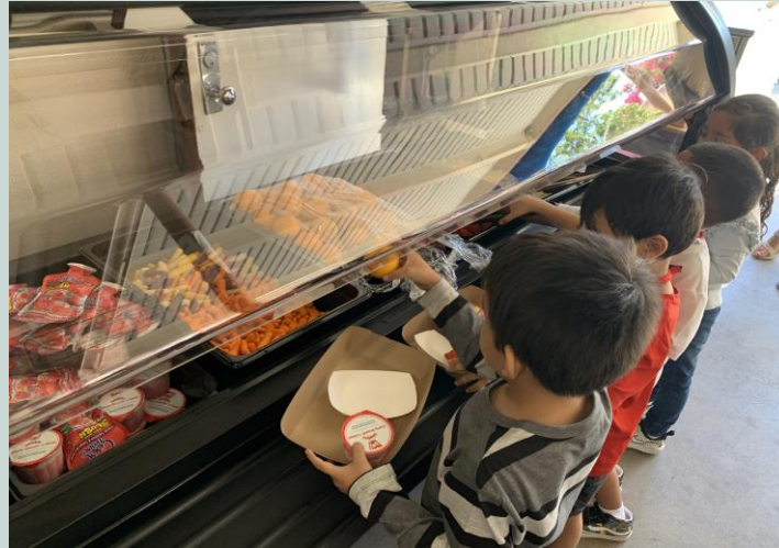
Salad and Fruit Bar Barra de ensaladas y frutas