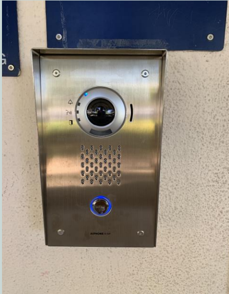
Security Camera and Buzzer Cámara de seguridad y zumbador