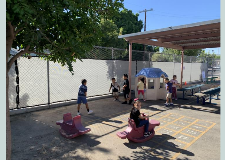
Privacy Fence Valla de privacidad